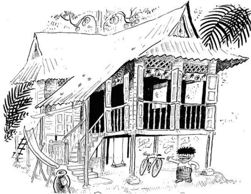
Figure 2: The illustration shown is the typical traditional Malay houses in kampongs built on stilts

Source: Original illustration by Lat in the Kampung Boy