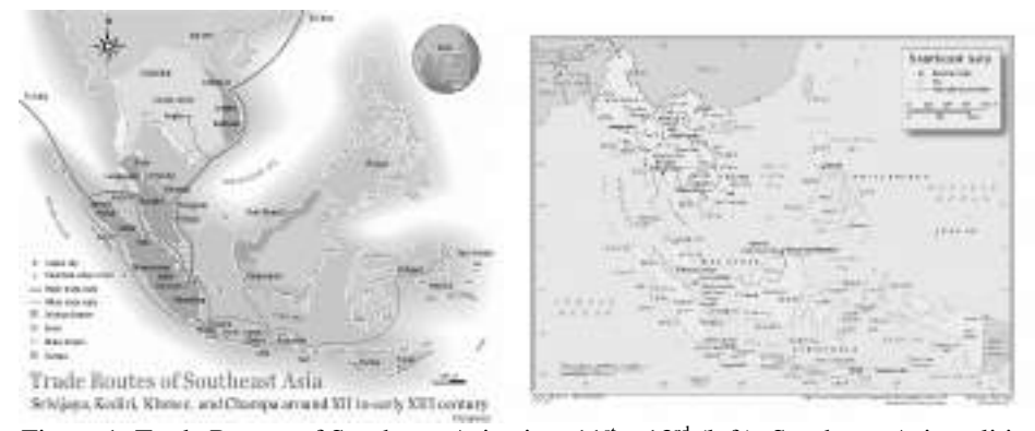
Figure 1: Trade Routes of Southeast Asia circa 11<sup>st</sup> – 13<sup>rd</sup> (left); Southeast Asia political map as seen today (right)

"...human kind's greatest creation has always been its cities." Kotkin, J. (2006)