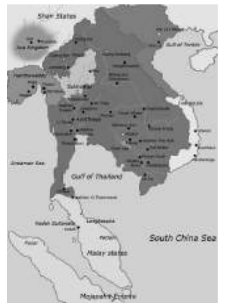
Figure 2: Map of Southeast Asia circa 1400 CE, showing Khmer Empire, Ayutthaya Kingdom, Lan Xang kingdom, Sukhothai kingdom, Champa, Kingdom of Lanna, Dai Viet and surrounding states.

Religious and sociology were one of the most influential aspects that affected the local and indigenous lifestyles, custom and practices. Trading and religious activities took advantage as part of the exchange of cultures and beliefs. Siamese society reflected Theravada values, which emphasised gentleness and meditation (Lockard, 2009: 59) but unlike in Vietnam, where Chinese influence was much greater, adopted an imperial system in which the emperor was considered a 'son of heaven'. Malaysia (and Indonesia) strongly practiced Islam after the spread of Islam from the Middle East in 1300s. Expansion of Islam in Southeast Asia conceded with the rise of the great port of Melaka in early 1400 (Lockard, 2009:65).