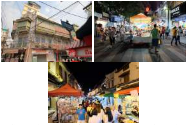
Figure 4: Illustrated the streets scene from cases study, Bangkok (left); Hanoi (middle); Melaka (right)

merchants. Bangkok City with the arrangement of zoning regulation emerged the area for Sino-Siamese resident, which later named as China town. Since 1853 The Chinese settlement in Sampheng had become the bustling market with full of supply for wholesale and retail product. Sampheng as the heart of Chinese community in Bangkok, represent the ideology of commercial area of Siam until today.