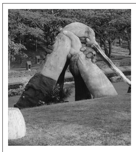
PICTURE 4: Sculpture located at Legend Park symbolises the fight between Mat Chincang and Mat Raya

As the legend goes, centuries ago there lived two feuding giants called Mat Chincang and Mat Raya. A third giant, Mat Sawar (sawar is colloquial for sabar or patient), attempted to reconcile them. As fate would have it, Mat Raya's son and Mat Chincang's daughter fell in love with each other and wanted to marry. Although Mat Chincang was not in favour of the plan, he nevertheless consented. Mat Raya, on the other hand, welcomed the union as he thought that it would help heal the animosity that had long existed between the two families. However, during the marriage ceremony an argument broke out between the two giants, which then led to a fight. The ferocity of the fight resulted in the pots and pans and other utensils used to prepare the wedding feast being flung to