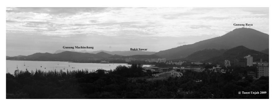
Picture 3 : Locations of Mount Machineang, Mount Raya and Sawar Hill