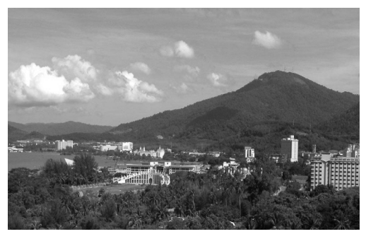
Picture 1 & 2 : Gunung Raya - highest mountain on Langkawi islands formed of granite rock

The island possesses long geological history that dates back to the early Cambrian period (Mohd. Shafeea Leman et al. 2007), with unique geodiversity and geological landscapes, which form many geoheritage sites. Among the main attractions of Langkawi Geopark are its oldest rock formation of high geological value, pristine beaches and education based tourism. Within the Langkawi Geopark are located three geoforest parks: the Machincang Cambrian Geoforest Park, Kilim Karst Geoforest Park and Dayang Bunting (trans. Pregnant Maiden) Marble Geoforest Park.