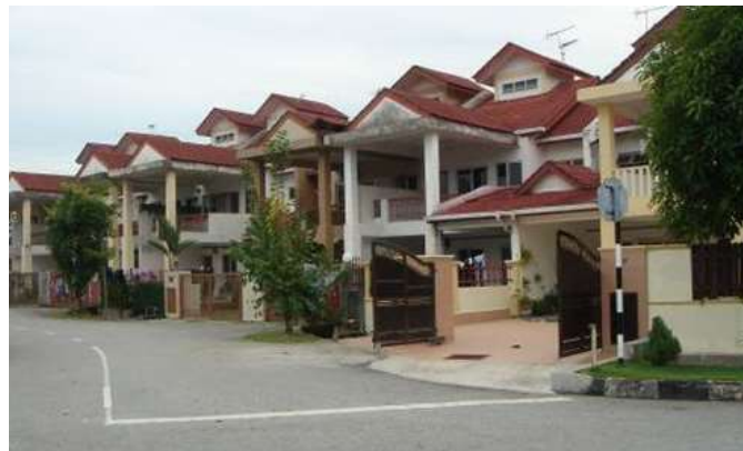
Figure 1: Contemporary terraced houses

Terraced house designs were introduced in Malaysia (then Malaya) around the beginning of the twentieth century during the early years of British colonial rule. Based on the British terraced home designs, the houses usually have only two elevations: the front and back. The living quarters and the main bedroom are located at the front of the house, and the kitchen and other bedrooms are at the back. Mass contemporary and intrinsic terraced houses have been built since the late 1960's, but the design of the buildings has not evolved much since its predecessor (Figure 1).