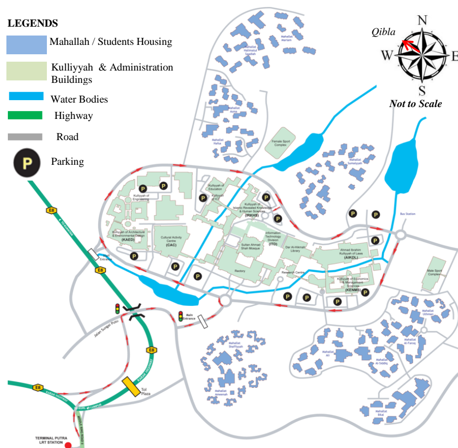
Figure 1: Main Campus of International Islamic University Malaysia

students of IIUM are free to choose any travel modes that they prefer to go to Kulliyahs from their Mahallahs for attending classes. The available travel modes for the students within the campus are walking, cycling, public transportation and private vehicle. The campus also provides intra-campus bus services for the IIUM community. However, these services are limited and provided only to those students staying at the selected Mahallahs.