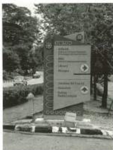
Figure 4: Existing condition