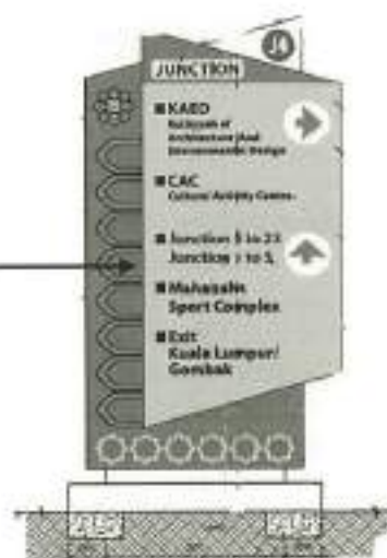
Figure 5: Example of recommendation

In this context, the differences between letter and its background will enlighten the image due to the contrast of the background colour against dark lettering coloured of the sign. Even though the location of the signage is strategic, reasonable size and colour contrast are important for the sign to be effective.