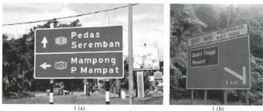
Figure 1: Example of informatory sign