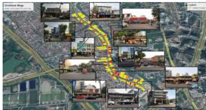
Figure 6: Land Use, Building Condition Bendungan Hilir Street