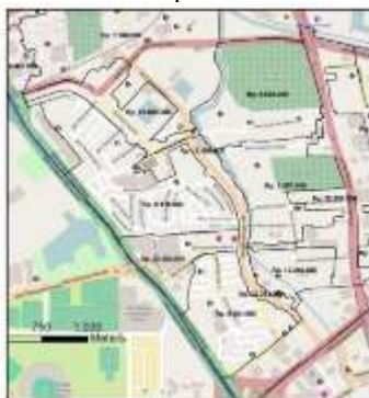
Land Price Map 2013