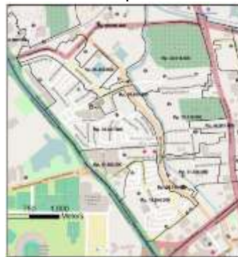
Figure 3: Land Price Map, Bendungan Hilir Area, 2013-2018