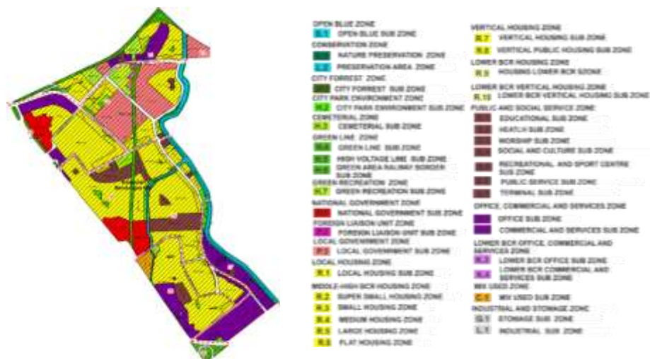
Figure 5: Spatial Detailed Plan for Bendungan Hilir Area, the Sub District of Tanah Abang