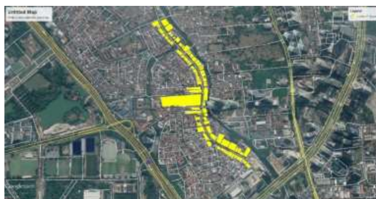
Figure 2: The Commercial corridor in Bendungan Hilir Street