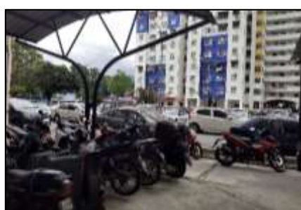
Photo 1: Crowded parking spaces at PPR Pantai Ria