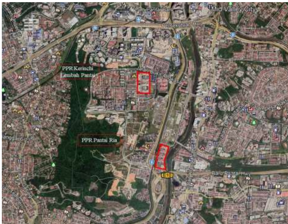
Figure 1: Study areas and its surrounding developments

Ria low-cost flats are located near to Pantai Dalam commuter station, while Kerinchi Lembah Pantai low-cost flats are located near to Pantai Hillpark which can access with New Pantai Expressway (NPE). The Pantai Ria flats are located near to Pantai Sewerage Treatment Plant 2 and Pantai Eco Park Community Center. Besides that, the Pantai Ria flats' location is beside Klang River (see Figure 1). For the Kerinchi Lembah Pantai flats, they are located near to Bazaria Pantai, Lembah Pantai Library Complex and Masjid Al-Iklasih.