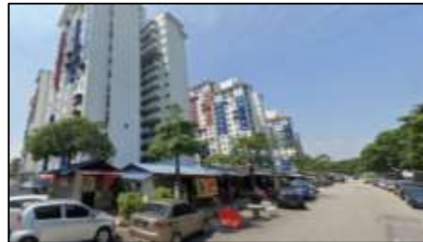
Photo 4: PPR Pantai Ria residential building

Based on the results shown in Table 4, the number of respondents feeling anxious in crowded spaces was similar for both PPR Pantai Ria and PPR Kerinchi Lembah Pantai. There were 31 respondents (60.8%) who did not have an anxiety feeling at crowded spaces, while 3 respondents (5.9%) had a feeling of anxiety at a good part of the time. For the “experience trembling when they are in crowded spaces” and “stress feeling in crowded spaces”, there was a slightly higher percentage of respondents at PPR Pantai Ria who experienced trembling and stress feeling in crowded spaces during “a good part of the time” or “most of the time” (see Table 4). The data showed a higher mental health problem in more crowded area, for example, PPR Pantai Ria with smaller size of apartment units and smaller roads.