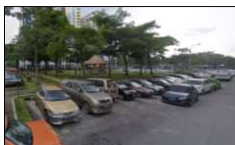
Photo 2: Less crowded parking spaces with green spaces at PPR Kerinchi Lembah Pantai