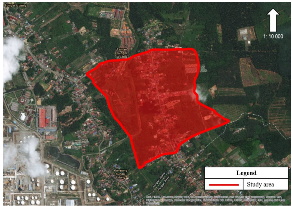
Figure 1: Boundary of Kampung Paya Rumput Jaya, Sungai Udang, Melaka

Kampung Paya Rumput Jaya was located in the district of Melaka Tengah covering the area of 1160 acres (Fig. 1). The overall population living in the village is 1557, which consists of 1527 Malay residents (98%) and 30 Chinese residents (2%). The village is one of the traditional villages in Melaka whose settlement began in 1705. The village was established by four friends from Kerinchi, Sumatera, known as Malim Panjang, Malim Sigai, Tuan Fakeh Ali and another one whose name is unknown. During their arrival, they encountered a Kelinting tree at a swamp forest. The size of the tree was four metres in circumference, and it was coated with wild grasses from top to bottom. Thus, the four friends named the village "Paya Rumput" after the name of the grass.