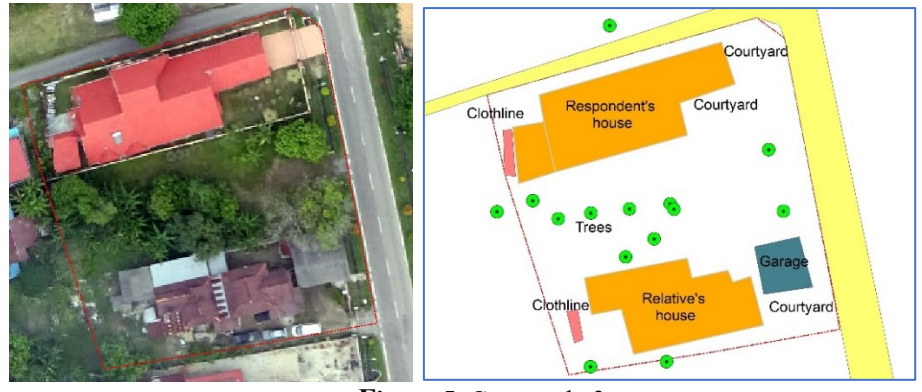
Figure 5: Case study 3

Fig. 4 shows one parcel within the village in Case Study 2. The sketched plan of the house shows a parcel of the respondents' houses. The houses are all located within the same lot of land. The houses are orientated to the main road and just nearby to the relatives' houses. One respondent's family runs a stall in front of their house, which is strategically located by the main road. This finding also shows the value of a strong family relationship in the respective parcel. Many trees can be identified around the compound, particularly those at the back of the house. The material of the courtyard is asphalt. A shared courtyard can be used for collective activities of the family members. At the middle and side of the compound are palm trees, which provide a shaded and cool environment, hence a resting area for the villagers.