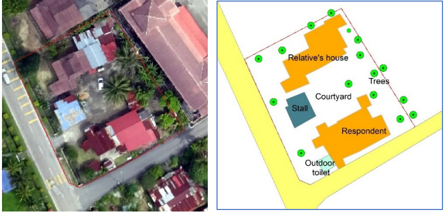
Figure 4: Case study 2

Fig. 4 shows one parcel within the village in Case Study 2. The sketched plan of the house shows a parcel of the respondents' houses. The houses are all located within the same lot of land. The houses are orientated to the main road and just nearby to the relatives' houses. One respondent's family runs a stall in front of their house, which is strategically located by the main road. This finding also shows the value of a strong family relationship in the respective parcel. Many trees can be identified around the compound, particularly those at the back of the house. The material of the courtyard is asphalt. A shared courtyard can be used for collective activities of the family members. At the middle and side of the compound are palm trees, which provide a shaded and cool environment, hence a resting area for the villagers.