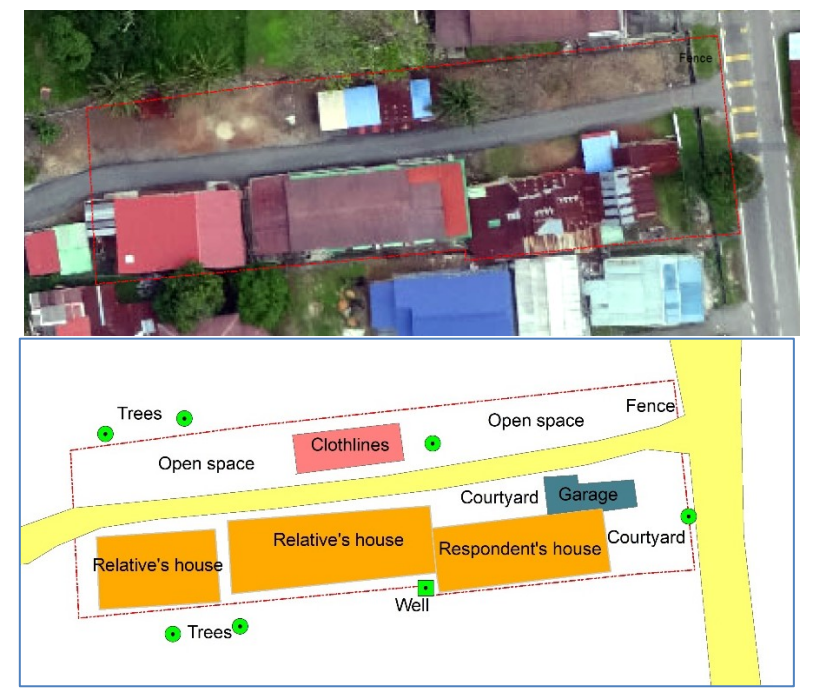
Figure 3: Case study 1

Fig. 3 shows the illustrations for Case Study 1. One of the respondents' houses is located in front of her relatives' houses, which are located within the same lot of the land. The kinsfolks prefer to stay close to each other to assist each other in daily activities if necessary, thus indicating a socio-culture value of a strong relationship, cooperation, and consensus. They are also comfortable living with a family. Such value also reflects the respect among the family members.