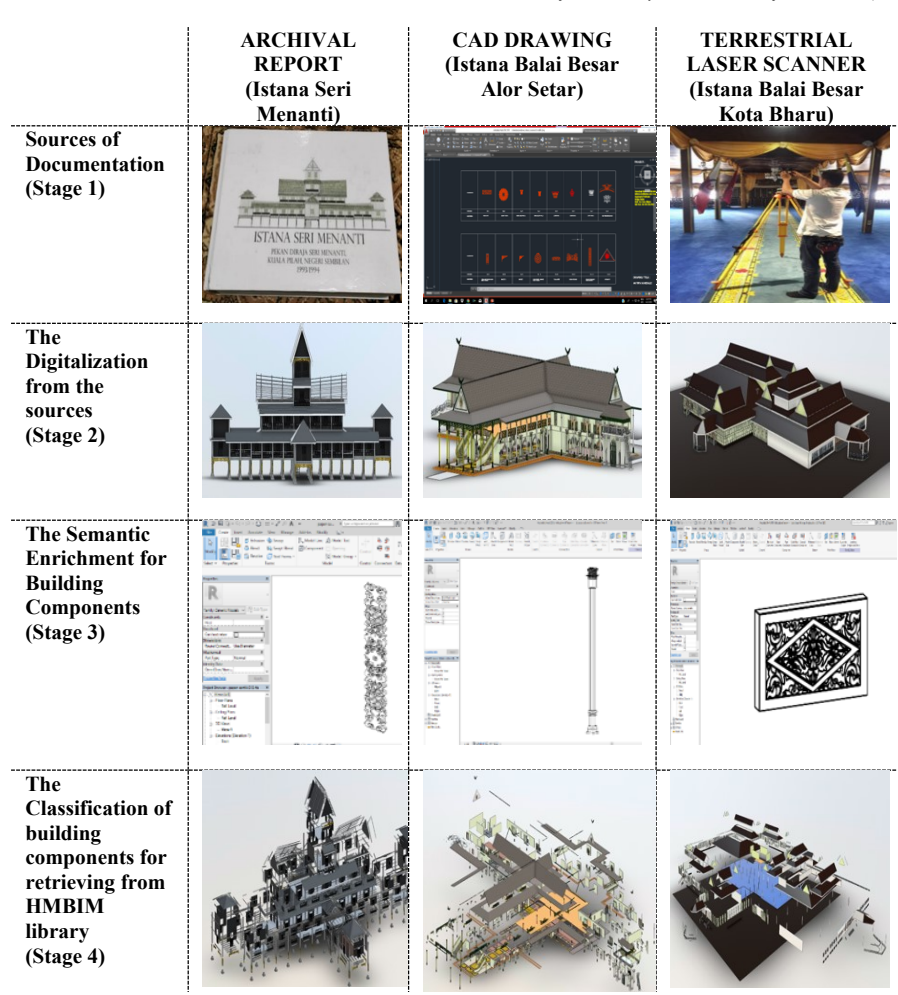
Figure 1: The process and result for BIM digitalization using multiple approaches