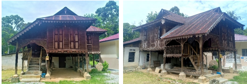
Figure 1. Rumah Limas Bumbung Perak