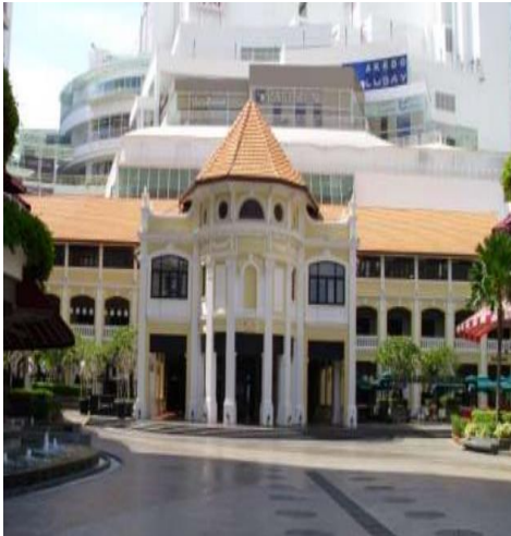
Figure 2: Image of the St. Joseph's Novitiate at 1918 and 2017

De La Salle, a Roman Catholic religious teaching order, pioneered mass education in Malaya as well as other places around the world. Novice clergymen came from the neighbouring countries of Singapore, Thailand, Myanmar, Hong Kong and Sri Lanka to complete their training in Penang. 1n 1918, the three-story St. Joseph's Novitiate was built facing the seafront along the North Beach of Penang Island, or Gurney Drive, as it is now known. St. Joseph's Novitiate was further extended in 1925 with the construction of a chapel attached to the middle section, creating a T-shape in the building's floor plan. This brought the total floor area to approximately 40,000 feet. The chapel, then known as St. Joseph's Chapel, was built under the supervision of Brother Cajetan L'Homaillfe of France, who was knowledgeable in the field of architecture. The beautiful stained glass windows were brought from Italy, and the altar and railings were made from imported marble. In the year of its completion, the exterior wall of the former chapel was carved—ANNO SANCTO MCMXXV, in Latin meaning 'holy year 1925', which was when the extension was completed.