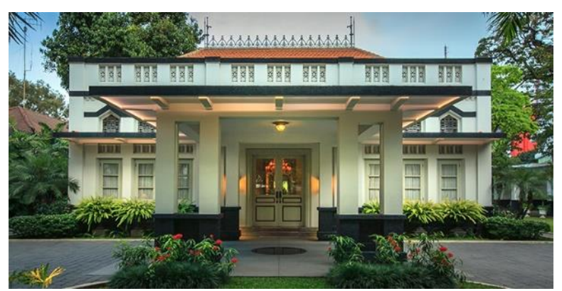
Figure 4 The Current Building Façade