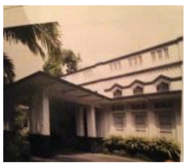
Figure 3 The Building Façade in the Past