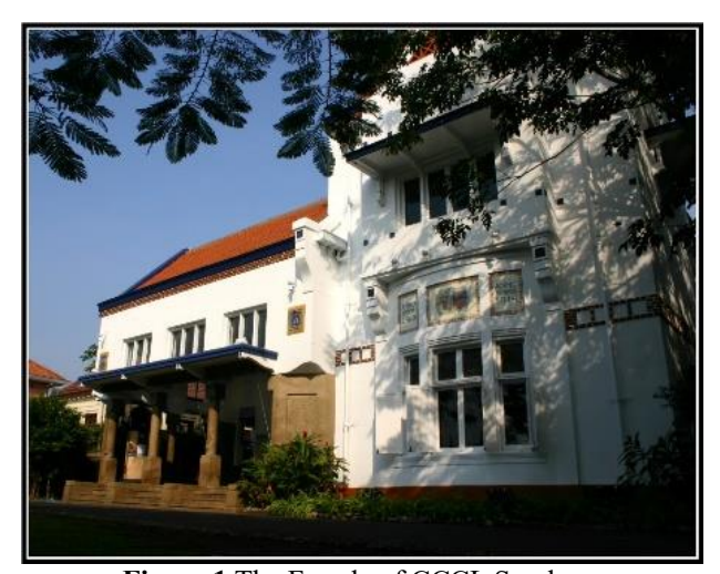
Figure 1 The Façade of CCCL Surabaya

In order to accommodate the concept of this restaurant, this building has undergone several major renovations in some parts of the buildings, both exterior and interior. Since this building is categorised as the B class, any restoration, rehabilitation or reconstruction works are acceptable in order to maintain the original characters of the buildings. The façade of this building is still similar although there are some effects of the alterations can be seen (refer to Fig. 1 and 2).