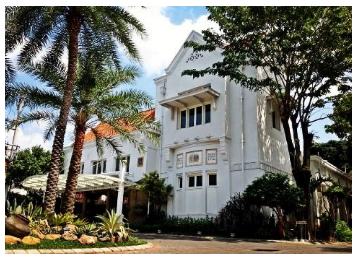
Figure 2 The Current Façade of the 1914 Restaurant