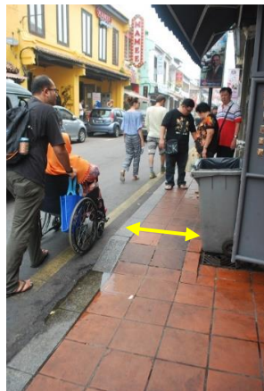
Figure 3.1 The Width of Sidewalk is Narrow at Some Locations