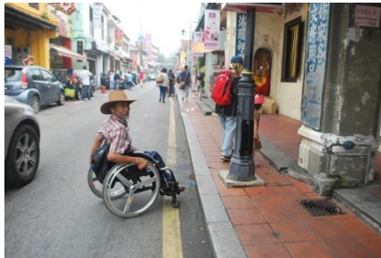
Figure 2.1 Obstructive Elements Along The Sidewalk: Lamp Post

the sidewalk is too narrow. Width of sidewalk is also affected by peddlers and shop owners using the sidewalk to display their merchandise. Poor maintenance include broken surface of the sidewalk and missing tiles from the sidewalk surface.