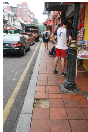
Figure 3.2 Poor Maintenance of Pavement Surface Create Barriers for PwDs