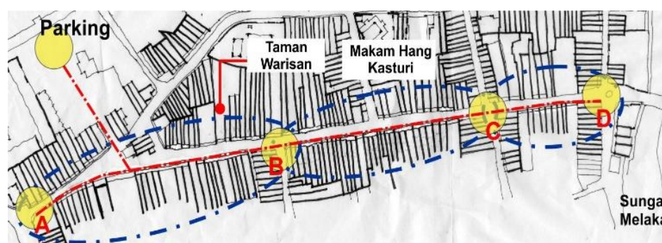
Figure 1 Journey of PwDs Base on 5 Main Stations

One of the main outputs of the access audit was a layout plan of the study area indicating the accessible routes along the Jalan Hang Jebat. For the study area, five main pit stops were identified along the street (Figure 1). The destination to each point was analysed, measured and marked. The results of the access audit are as in Table 1 below.