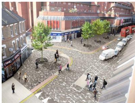
Figure 4.2 An Example of Shared Space Approach