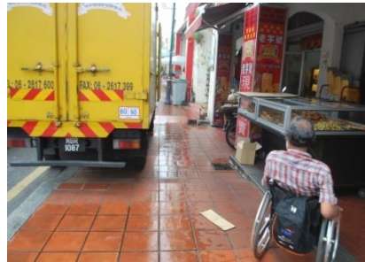
Figure 2.2 Loading Activities Obstructing the Accessibility of Sidewalk Especially for Wheelchair Users and Visual Impaired Persons.