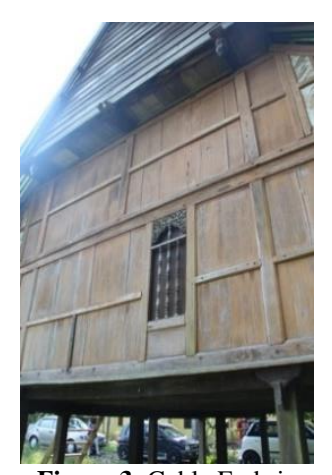
Figure 3 : Gable Ends in RK

The relationship between man and environment (hablumminal 'alam) is clearly interpreted in both RK and RA. Both houses respond to the hot and humid climate that are manifested in raised form, elongated building form on the east and west axis, open plans, high ceilings, large roof overhangs and low thermal building materials alongside some other strategies to work with the climate. The basic idea of the traditional houses is to use the climatic factors to advantage and ameliorate harsh effects of the environment for the comfort of man. In agreement with the wisdom principles in traditional architecture, the houses were designed to optimize the given climatic conditions and the surrounding environment. The houses optimize natural ventilation to avoid heat and humidity accumulation; for example, RA and RK have the carved, or split gable ends on the wind path to facilitate cross and roof ventilation (Figure 3 and 4). While RK has a simple pitched roof ranging from 50-60 degrees that provides space for ventilation and cooling that support the thermodynamic process to flow out the heat from the inside to outside. Wall ventilation and raise floor help to avoid the heat accumulation, because of external or internal heat gain through gaps in the floorboards and walls in both RA and RK.