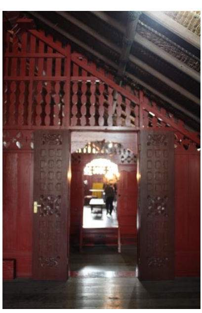
Figure 6 Carvings of Geometrical Motif on an Internal Partition at RA

The carvings are also a reflection of the owner's social status; the richer the carvings, the higher the status of the owner. Floral motifs were inspired from bunga Melati (Jasminum sambac), daun keor (M. oleifera), sulur pakis (diplazumesculentum), rebung (Dendrocalamus asper), kupula (mimusop elengi), pisang (Ravelana madagascariesis), bunga matahari (Helianthus anuus), rambutan (Nephelium lappacium) and pucuk labu (Cucurbita moschata). On the other hand, the fauna motifs were inspired from butterfly or kupu-kupu (Danaus sp.) and grasshopper or belalang (Oxy asp.). The application of carvings is a response to social-cultural background, climatic and geographical factor. The higher the status of the owner, the more ornate the carvings of the house. For example, the wall for RK are made of wood panels and carvings for higher ranking people, and weaved bamboo panels for commoners.