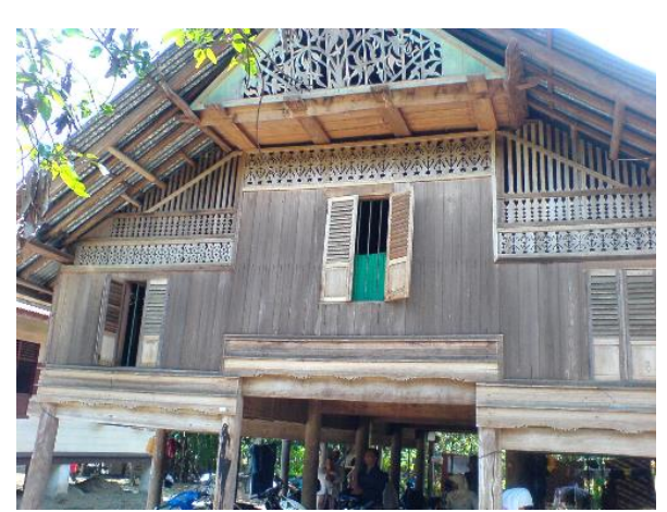
Figure 4 Carved Gable Ends in RA

The carvings implemented in RK and RA is another evidence of hablumminal'alam . Carvings on the houses depicted the entities from the surrounding environment depicting flora and fauna motifs (Figure 5). In older houses, there are carving motifs of fauna figures such as monkey, snake and bird that may have existed during pre-Islamic times in contrast to the floral motifs