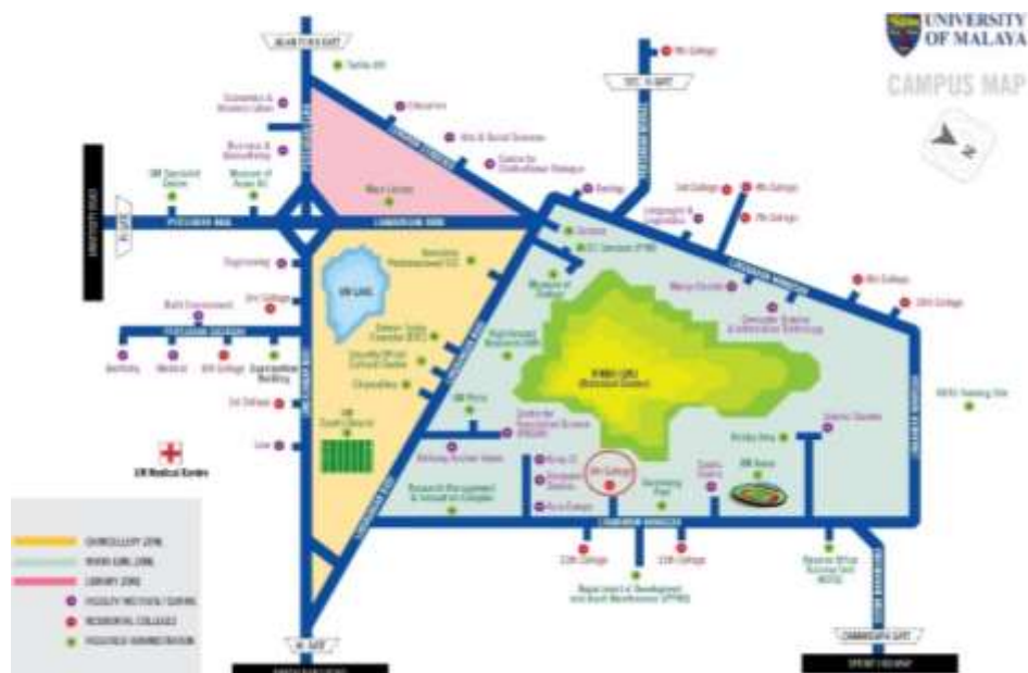
Figure 1: The location of Dayasari RC in UM campus (University of Malaya, 2015).

The building arrangement is based on the internal courtyard arrangement that encourages various implementations of bioclimatic design concept, especially under the day lighting and natural ventilation conditions (Jamaludin et al., 2011). The typical room's floor area and volume are 16.35\text{m}^2 and 45.78\text{m}^3 , respectively. A typical elevation and floor plan of Dayasari RC is presented in Figure 2.