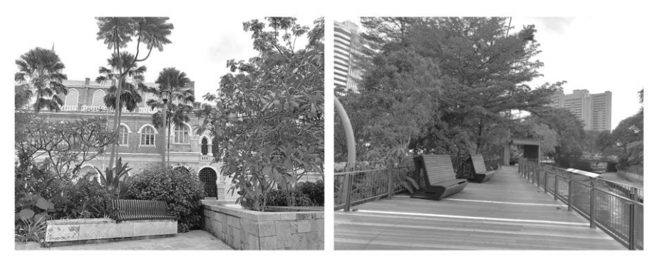
Figure 5: Strategically positioned streetscapes within the study area offer users comfort-enhancing qualities.

The streetscape along a river serves as a pivotal factor in establishing comfortable spaces. Referring to the qualities of comfort, the public spaces located along these rivers are well equipped with streetscapes such as seating, landscaping, and pedestrian pathways (Figure 5). The seats for example are conveniently located in the sun or shade that contributed to the creation of inviting environment and conducive to the users. In addition, these public spaces also provide visually unblocked pathways (Figure 3). Therefore, it created a sense of safety by providing clear sightlines, minimizing hidden corners, and enhancing overall visibility. This transparency foster a perception of openness, reducing potential hiding spots and promoting a secure environment through increased awareness of surroundings.