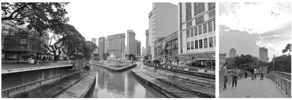
Figure 7: Most activities are centred around the convergence of the river near Masjid Jamek and the Sultan Abdul Samad Building.

Major nodes that become the main meeting point can be seen on the south part of the rivers, facing the Masjid Jamek and the Sultan Abdul Samad building. The water features situated at the confluence, along with the bridge spanning along Sungai Gombak, have attracted a greater number of users, including tourists, to visit this area (Figure 7). However, moving to the south of the area, most of the users used the space as main linkages to the transportation hubs.