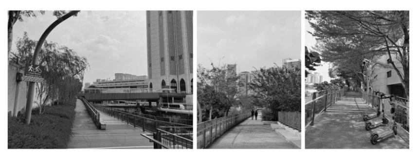
Figure 3: Access and linkages located along Sungai Klang and Sungai Gombak that can easily access in a diversity of ways.

Accessibility analysis from the site observations shown that the access and linkages to the north of Sungai Kelang and Sungai Gombak, and to the south of Sungai Klang are well maintained and accessible in a diversity of ways — walking, cycling and micro-mobility (Figure 3). However, there is an unwelcoming area underneath the city's elevated Pasar Seni Light Rail Transit (LRT) Station that had created a barrier between the Pasar Seni and Jalan Benteng. But with shade from the sun, this site can be an ideal place to potentially be revived (Figure 4).