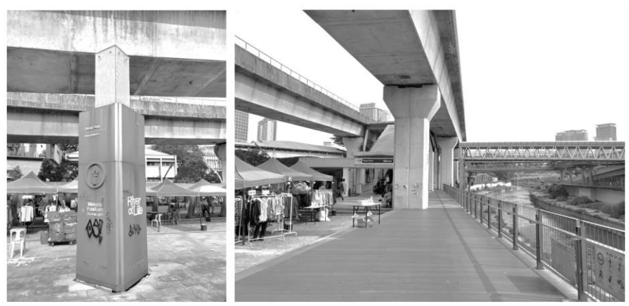
Figure 8: Rows of stalls offering a diverse range of local foods and artwork.

For spaces located near Pasar Seni or Central Market, the temporary night market set-up underneath the Pasar Seni LRT Station has become a popular social gathering spot for users (Figure 8). Featuring stalls offering a diverse range of local foods and artwork, this location has inadvertently evolved into a renowned hub for users.