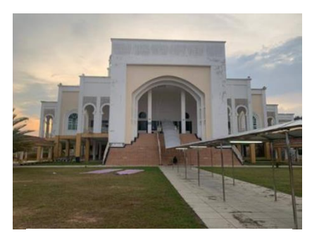
Figure 3. Defect: peeling of paint (external wall)