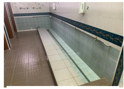
Figure 5. Defect: poor ventilation in wet areas Source: Authors (2024)

Figure 4. Defect: stagnant water Source: Authors (2024)