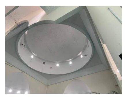
Figure 2. Defect: water leaking

Structures develop defects due to various reasons. Structural problems affect components like the foundation, beams, and columns and can result from poor planning and policies, workmanship, or materials. Figures 2, 3, 4, and 5 illustrate these defects. Water-related issues stem from infiltration, leakage, or flooding linked to waterproofing, plumbing, or drainage flaws. Electrical faults involve wiring, fixtures, and appliances and are potentially dangerous. Other issues include problems with finishes, doors, windows, and external factors like noise and air quality. Research shows defects arise from poor design, construction, maintenance, and a lack of control. Maintenance management errors cause 30% of construction faults. Effective maintenance practices that address issues early can extend a building's life and prevent costly repairs.