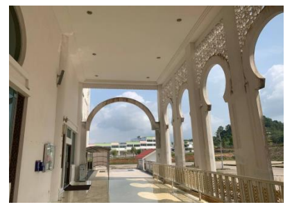
Figure 4. Defect: stagnant water

Evaluating the Impact of Design Failure on the Perak Tengah District Mosque