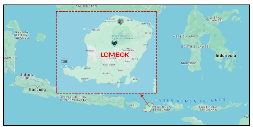
Figure 2: Map of the research location (Source: Google Map, 2024)

This study employs a quantitative research design to examine the influence of perceived tourism benefits (economic, social, and environmental) on local community support for rural tourism development in Lombok, Indonesia, with political bureaucracy as a moderating variable. The map of the research location is depicted in Figure 2. The research adopts a cross-sectional survey approach, collecting data using online surveys distributed via Google Forms. The survey targeted Lombok residents, focusing on those aged 18 and above and engaged in various sectors, including tourism, agriculture, education, and government. Based on G*Power estimates, this investigation required at least 95 samples. A total of 183 responses were received and used for the final analysis. The survey instrument was designed to capture the perceptions of economic, social, and environmental benefits, community support for tourism development, and political bureaucracy's influence. Each construct was measured using multiple Likert scale items ranging from 1 (strongly disagree) to 5 (strongly agree).