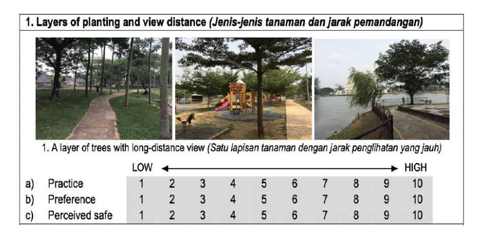
Figure 2: The place's image-based questions with 1 to 10 scores of Likert-scale