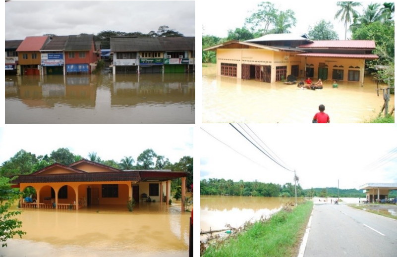
Photo 1: Flood in Padang Terap District