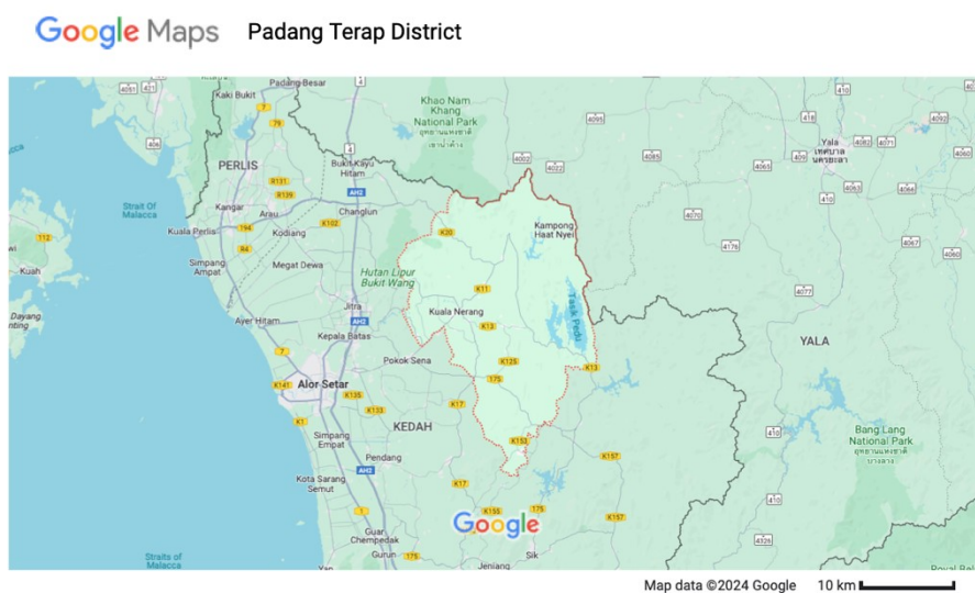
Map 1: Padang Terap District

Malaysia in 2010, amounting to RM 45,076,000.00, of which RM20,405,000.00 was for the state of Kedah (MKN, 2011). This figure shows the high financial implications for the government in dealing with flood disasters. This increase in cost reflects the weak flood adaptation strategy in this area. The people facing the floods are the ones who suffer the most because they are weak and unprepared. Therefore, a flood risk management strategy must change the defenceless flood-prone population to 'stronger' and from less prepared to 'more prepared' to face frequent flood disasters. Therefore, a reasonable approach should focus on adaptation efforts and not just dealing with problems "ad hoc".