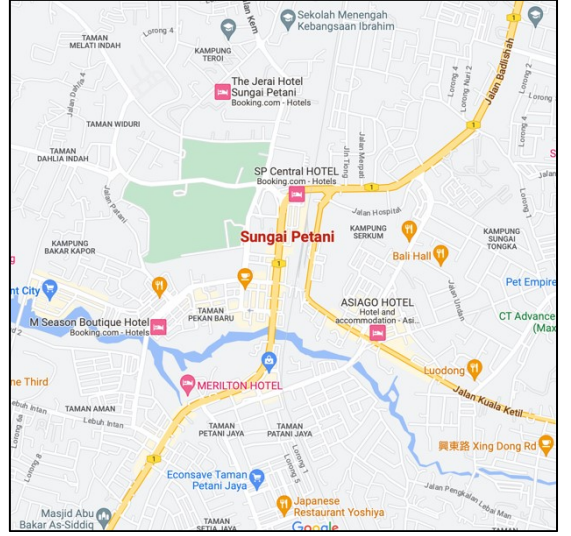
Figure 2: The location plan of Sungai Petani town.