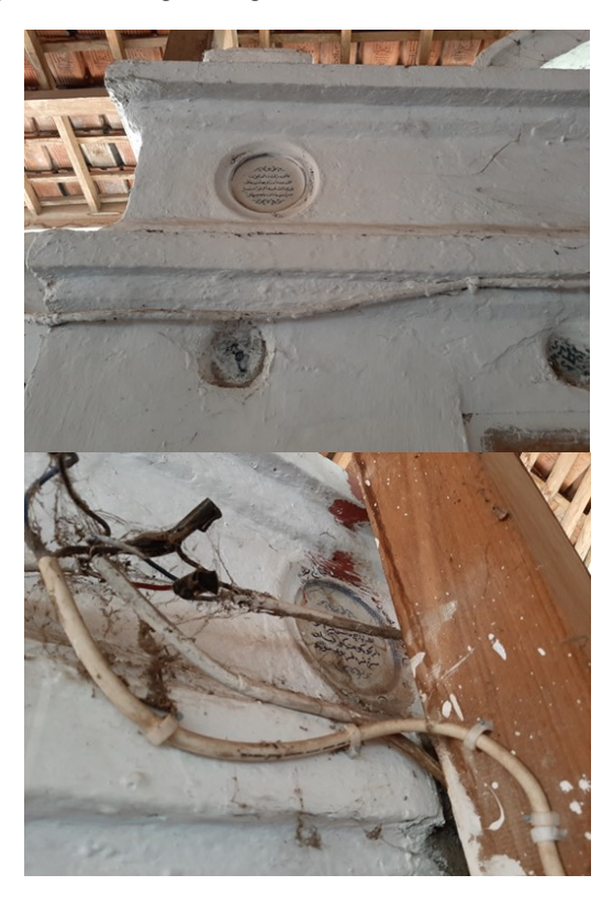
Figure 2: Ancient ceramics become a unique decoration in the grave complex of Sunan Gunungjati which is indicated to be damaged

The outcomes of the study demonstrate that the cover space in Astana Village's heritage area changed from 2006 to 2020. The results of the mapping show changes (see Figure 3). Since ancient times, mapping has been extremely beneficial for administrative, navigational, cultural, and other purposes (Hossain & Barata, 2019). Built-up land cover and the expansion of road networks are shown to cause changes in the mapping. The morphological circumstances of earlier use, whether agricultural land or the way it was used, often shape settlements (Dovey et al., 2020) should be able to communicate with one other. The road network development map enables access in the expanded land cover region, virtually completely surrounding the graveyard complex. Every seven years, there are huge changes in space.