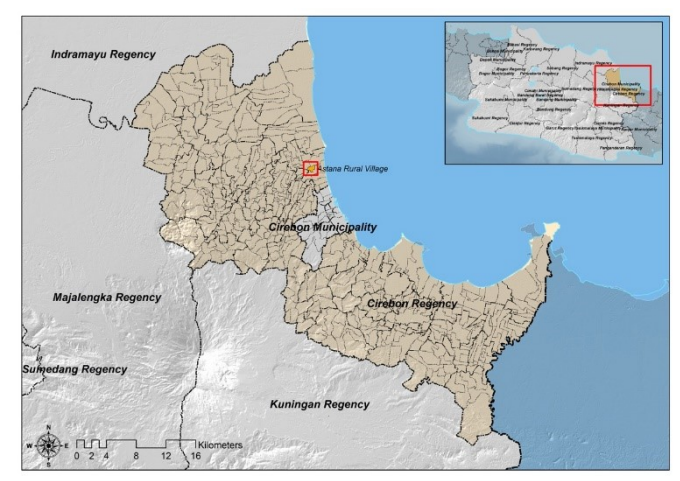
Figure 1: The Position and Location of Research Area

Astana Village is located in Gunung Jati District, Cirebon Regency. Cirebon Regency is located in the eastern part of West Java Province. With a geographical location of 108 \square 33 East Longitude and 6 \square 41 South Latitude (see Figure 1). The research location is located in the heritage area according to the regional regulations of Cirebon Regency. Sunan Gunungjati, a member of a walisanga (Islamic preacher) and the King of the Cirebon Sultanate, uses the research area as a pilgrimage tourist attraction (Agustina et al., 2016). The condition of the artifacts in the tomb complex area will be related to changes in space in the area. The tomb complex has become a magnet for regional economic growth.