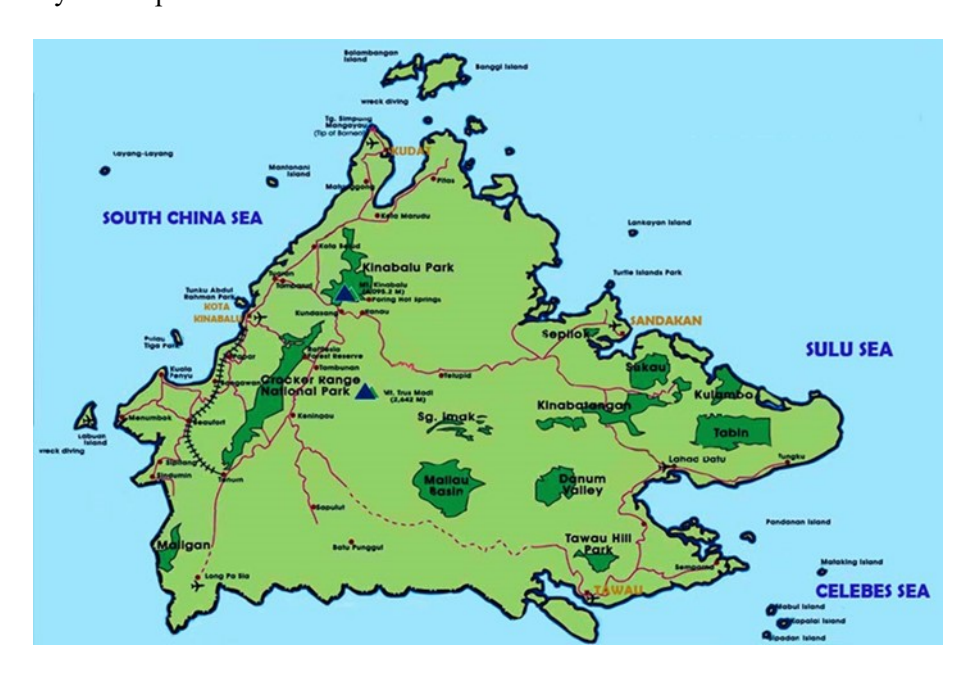
Figure 1: The study area in Kota Kinabalu, Sabah.

Sabah is a state that has the potential to be developed as a world tourism center with the theme of island tourism (such as Mabul Island), highland tourism (such as Mount Kinabalu), cultural tourism (such as ethnic Kadazan-Dusun), nature tourism (such as hot springs poring) and flora and fauna tourism (such as Hutan Lipur Sepilok). The speciality of the state of Sabah with an area of 73904 km2 has led to economic growth in the state and has become an attraction for the migration factor to occur, as the latest population (with data obtained in 2020) is 3418785 people (City Population, 2022). Suppose you look at the coordinates of longitude 5°15'N and latitude 117°0'E (Figure 1), Sabah. In that case, it cannot be denied that the state has an equatorial or tropical climate with an estimated temperature of 32°C (90°F) for the land area and an average temperature of 21°C (70°F) for the highlands. In other words, Sabah is a 'hot and sunny' state all year round. In addition, rainfall occurs frequently from October to February with the Northeast Monsoon season throughout the year, as well as hot or dry months in May and September.