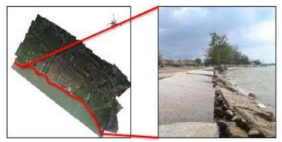
Figure 1: The Coastline of Taman Alai (Crystal Bay), Malacca

Melaka's Department of Valuation and Property Services (JPPH). Subsequently, secondary data collection involves data on residential sales transactions in the study area over four years (2014-2018). Although several residential developments are located on the West Coast (Malacca Strait) of Penisular Malaysia, this study's scope focused mainly on the Taman Alai Perdana (Crystal Bay) due to this residential scheme facing erosion problems, as shown in Figure 1. This residential scheme is situated in the Melaka Tengah district of the State of Malacca, which has a total coastline of 120.5 km, with 3.1% or 3.7 km being eroded. However, generally, the 73-km-long Malacca coast has a rhythmic form. The northern portion comprises headlands alternating with bays to form an offset coast. The southern part includes a series of shallowly scalloped bays with protrusions spaced at about 4.5 km.