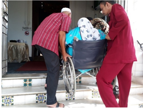
Figure 2: Difficulties to enter a heritage building