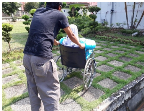
Figure 3: Unsuitable material used for the route to the accessible toilet

Heritage tourism is a cultural and social activity that is supposed to offer people a chance to interact with their past, cultural ties, and social context. It provides opportunities for social interaction, education about one's cultural heritage, and the growth of a feeling of self and belonging, including for disabled persons. Due to a number of physical and social barriers, however, many areas of heritage buildings and sites have not been accessible to disabled persons. Inadequate infrastructure, a lack of accessible features, and unfavourable attitudes from society are just a few of the difficulties that disabled persons have while trying to visit heritage tourist destinations. However, the study noted some successful attempts to increase accessibility in heritage tourism, including using adaptive technology, accessible transportation, and inclusive tour guides.