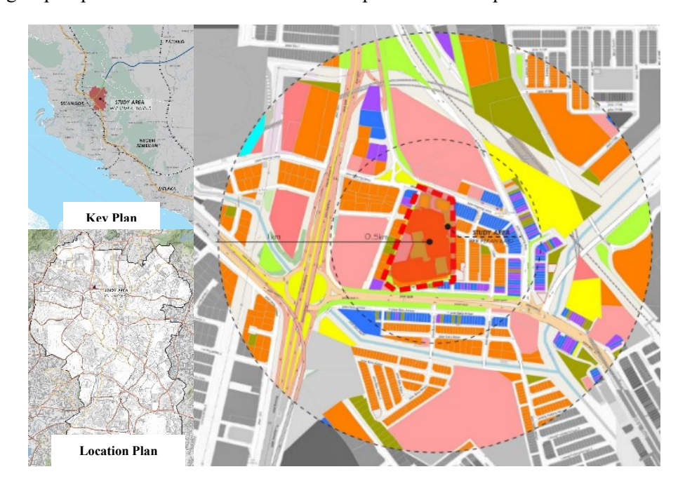
Figure 2: Study Area and its Adjacent Land Use within 1 km Radius

of 650 square feet. This area was selected as a case study as it was designed as the primary residential area surrounded by other residential properties such as 99 residences and Seri Wahyu Residence. It was also located near the public transportation (MRT Taman Wahyu, MRT Kampung Batu, MRT Batu Caves), public amenities and accessible facilities that provide additional services to the residents, including the PWDs. Apart from that, this PPR was a government project under an affordable housing scheme that aimed to assist mainly the B40 group to purchase their home at affordable prices with adequate facilities.