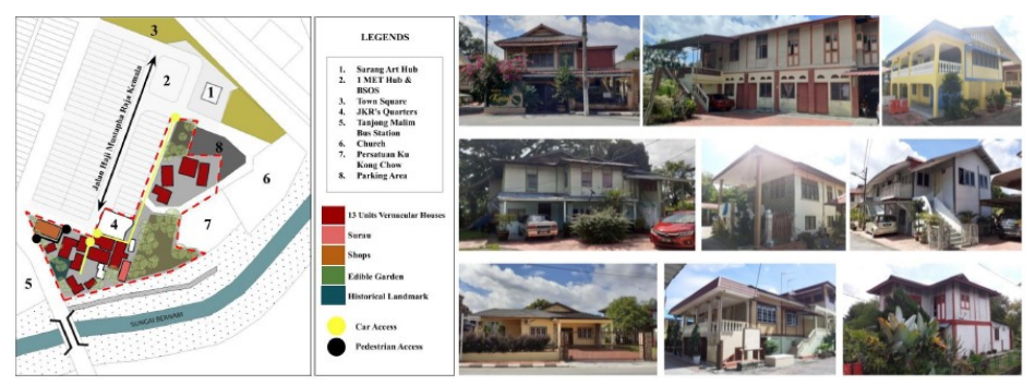
Figure 4: Village Layout and Traditional Malay Houses in Kampung Kubu

Kampung Kubu's layout remains a traditional Malay kampung located along the river. There are 13 traditional Malay houses, a surau , an orchard, an edible garden, and a compound for public activities (Figure 4). The residential areas covered 2 acres out of a total village area of 5 acres. However, some of the traditional Malay houses have been altered due to modernization, mainly influenced by the development of Tanjung Malim town and the need for bigger spaces due to the increasing number of family members. Most of the houses, inherited from their families, are two-storey buildings, where some of the upper floors are occupied by owners and rented to tenants on the lower floor. Seven out of 13 houses are surrounded by fences directly connected to the open road, while the other six are opened and built close to each other.