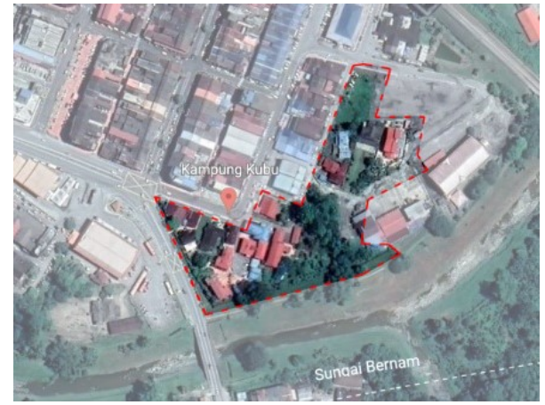
Figure 1: Location of Kampung Kubu in Tanjung Malim

Relevant local documents related to the history and development of Kampung Kubu are reviewed, and an interview with a villager, who is the 5th generation of Dato' Haji Mustapha bin Raja Kemala is carried out to reveal the heritage significance of the village. Field observation was also done to identify other significances of architecture and sociocultural attributes. However, this study is limited to an interview session with one person in the village due to the COVID-19 pandemic's Movement Control Order (MCO). Therefore, it avoids variation in the information collected on the history and background of the case study.