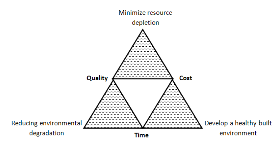
Figure 2: The new paradigm of challenges in sustainable construction Source: (Huovila & Koskela, 1998)

In most countries, labour costs comprise 30% to 50% of the overall project costs (Jarkas & Younes, 2014) and hence they are regarded as an important resource of the efficiency and success of the construction project. Apart from the aims to minimize the resource depletion, reducing environmental degradation, and developing a healthy built environment, the fundamental objectives of sustainable construction includes the criteria related to complete a project in accordance with specified time, cost and quality (Vučković et al., 2014) (Figure 2). Nevertheless, the shortfall of human resource has become the crucial risks that hindering the construction project in achieving sustainability (Awe et al., 2010; Becker & Smidt, 2015; Levanon et al., 2014).